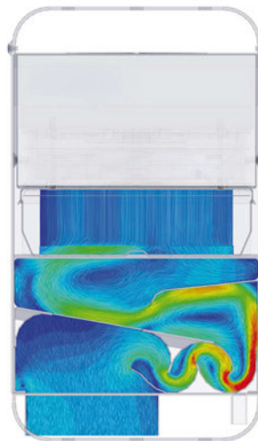
CFD figure 1: airflow simulation

Rentschler REVEN uses computational fluid dynamics technology to analyse airflow behaviour and optimise separating efficiency in industrial air cleaning. The computer software simulates the airflow behaviour, and the design of the device is continuously improved until the best possible separating efficiency for pollutant particles is achieved.